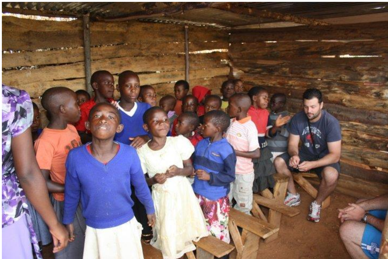
Some of the Beneficiaries at Mwendo Projects with Volunteers

MNCOP operates within a community with other 5 projects of same setting, also providing a range of services to the needy and vulnerable children. However these project centers do not have classes for children from Primary Five to Primary Seven of Ugandan Education. Therefore it was crucial for MNCOP to start and maintain the project of all primary school level for further education by the beneficiaries who are the needy and vulnerable children.